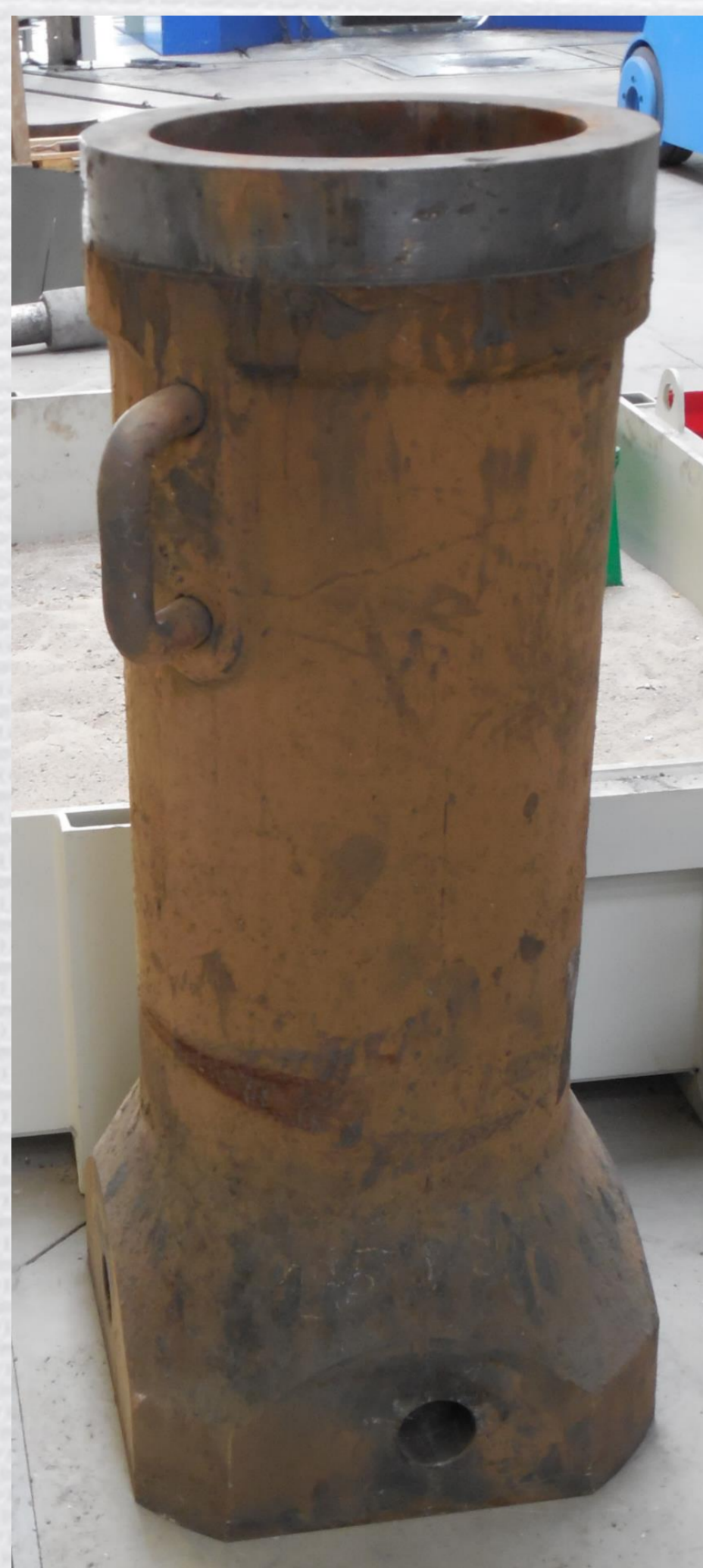
Round ingot 450 kg