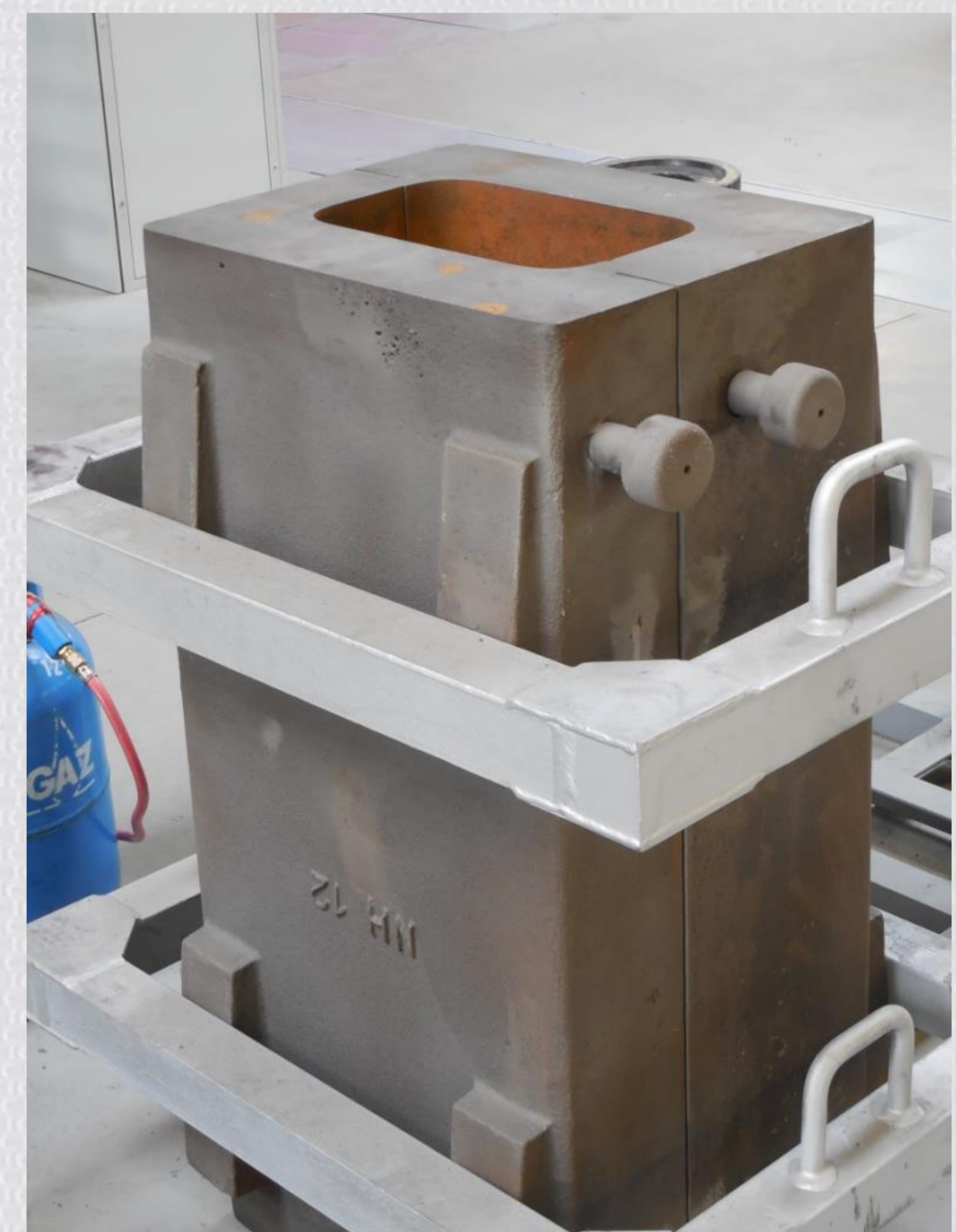
Flat ingot 500 kg